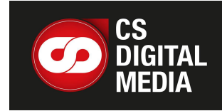
CS Digital NL